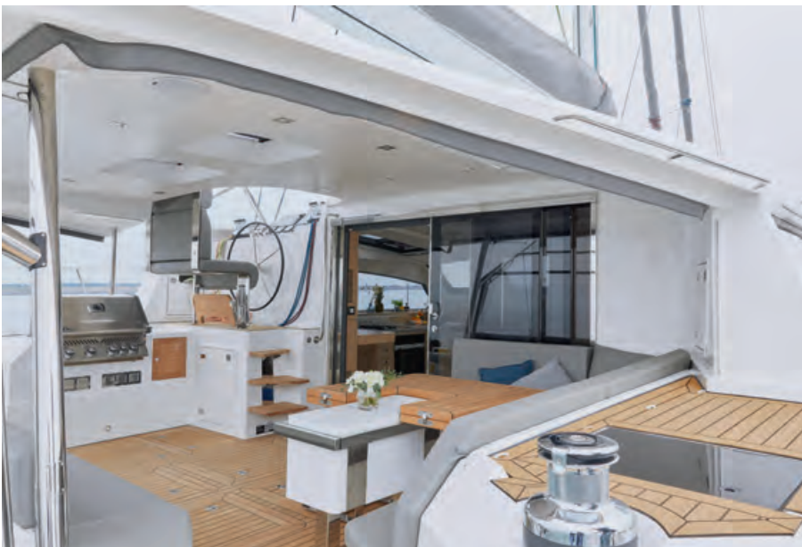
The cockpit is vast and perfectly protected by the imposing rigid bimini

The helm station is installed at half-height. Perfect, whether sitting or standing. ►