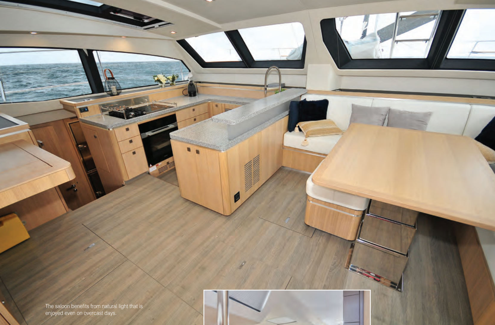
The saloon benefits from natural light that is enjoyed even on overcast days.