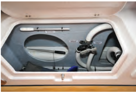
Great care has been taken in the assembly of all technical elements. A guarantee of longevity and ease of maintenance.