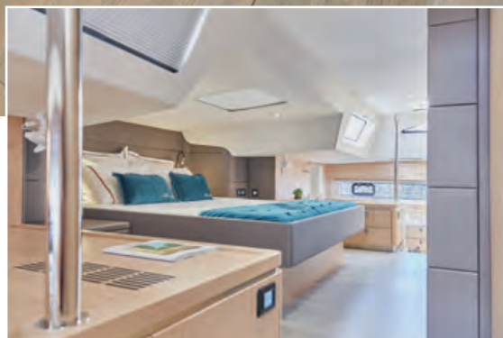
Forward, a very large Owner's cabin - not necessarily the most pleasant while under way. You can opt for other layout configurations.