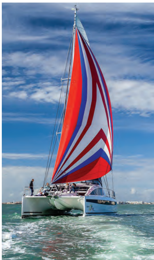
Mini central hull or big central chine? Either way, this is where the famous Owner's Suite is to be found.